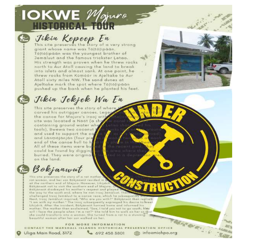
For More Information