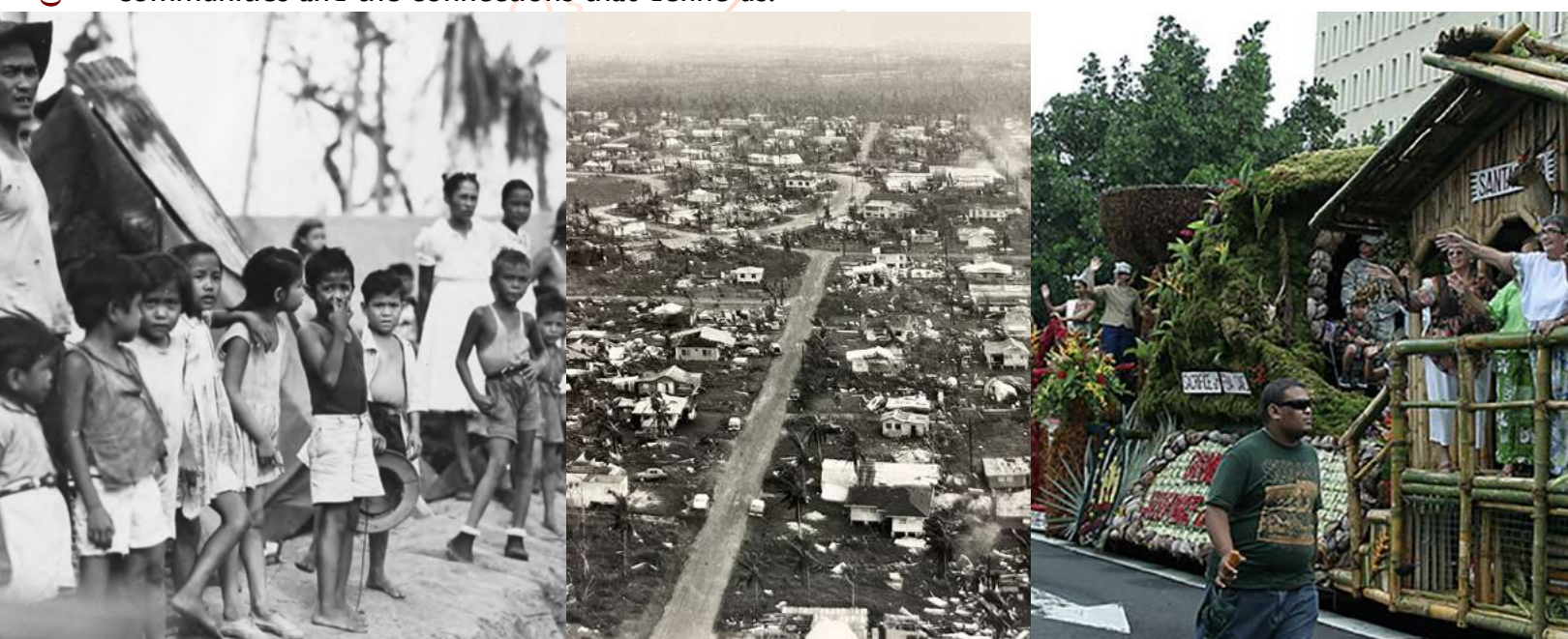
1944 Survivors of World War 11 • MARC 1962 Typhoon Karen, Dededo • MARC 2010 Santa Rita Liberation float

The period after a devastating storm is often referred to as a recovery period—homes are rebuilt, food and water are doled out, power lines are repaired. These are all done in an effort to "return to normal," back to the way things were before the storm. Another way to view this period is as a time of restoration, not just recovery. Now is a time to reinvigorate, strengthen, build up, rejuvenate. We can reflect on this time as an opportunity to breathe new life into our islands, and strengthen our communities and the connections that define us.