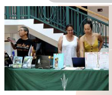
Semu 7. Collaboration with UOG Press

The grant award to Guampedia is from the Education Stabilization Funds (ESF), via the Guam Governor's Office. The funding is from the Coronavrus Aid, Relief, and Economic Security (CARES) Act to address the impact of COVID-19 to Guam's educational resources.