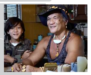
Lumamlam 9. Guampedia Heritage Gift Shop

Assist young artists & cultural producers register with CAHA & build online presense.