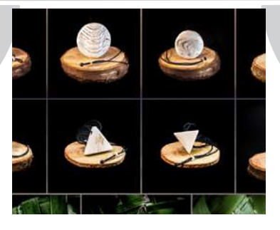
Tehnos 8. Collaboration with CAHA

Provide historically relavent materials & assistance.