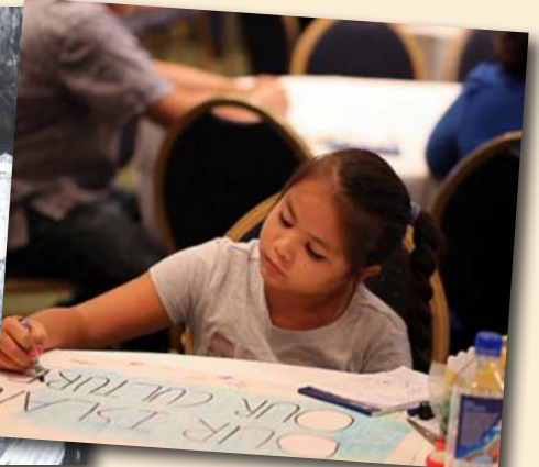
(1) CHamoru fishing illustrated by JA Pellion. (2) CHamoru youth and elder. (3) Young Marianas History Conference Participant.

When the United Nations adopted the 2030 Agenda for Sustainable Development in 2015, the international community recognized that education is essential for the success of all of its 17 goals. Goal four aims to “ensure inclusive and equitable quality education and promote lifelong learning opportunities for all” by 2030. Education is one of the key ways we address inequality, exclusion and work on healing our damaged planet. Doing so helps us make a peaceful,