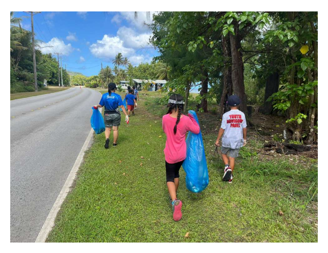
The roadside of "Nature's Treasure Island" gets a touch-up by students of Sinapalo Elementary School in Rota, The Marianas, as part of the Marianas Tourism Month cleanup on May 18, 2024.