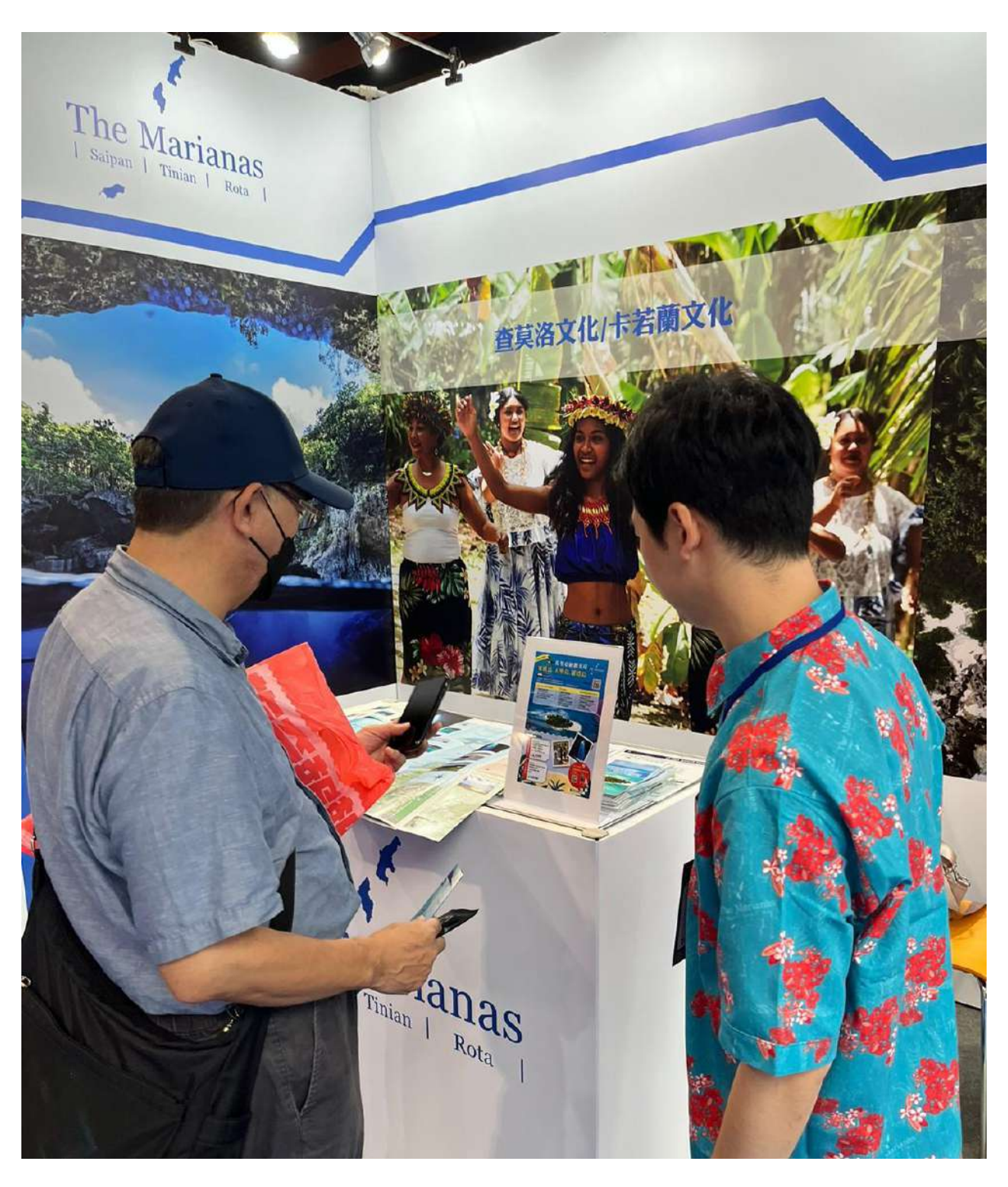
The Marianas Visitors Authority promotes The Marianas the Taipei Tourism Expo 2024 held on May 31-June 3, 2024, held in Taiwan at Taipei World Trade Center. The expo attracted over 307,000 attendees.